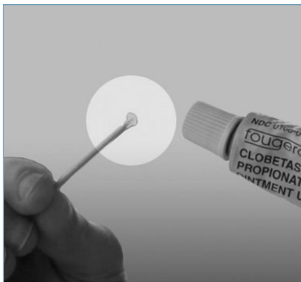
Figure 2. Demonstrating the Amount of Steroid Ointment to Use

Women with vulvar itching may scratch or rub and are not always aware of it, often at night. This can worsen the skin condition. For significant nighttime itching, consider use of a nighttime sedating agent. Nonprescription oral diphenhydramine (Benadryl) can be used. Hydroxyzine is a prescription antihistamine that has sedative and antihistamine effects; the typical dose is 10 to 30 mg orally about 2 hours before bedtime; instruct the woman to start with 10 mg and increase up to 30 mg if needed. If these are not effective, oral doxepin (10 mg about 2 hours before bedtime) may be tried for severe cases; it is much more potent than hydroxyzine.