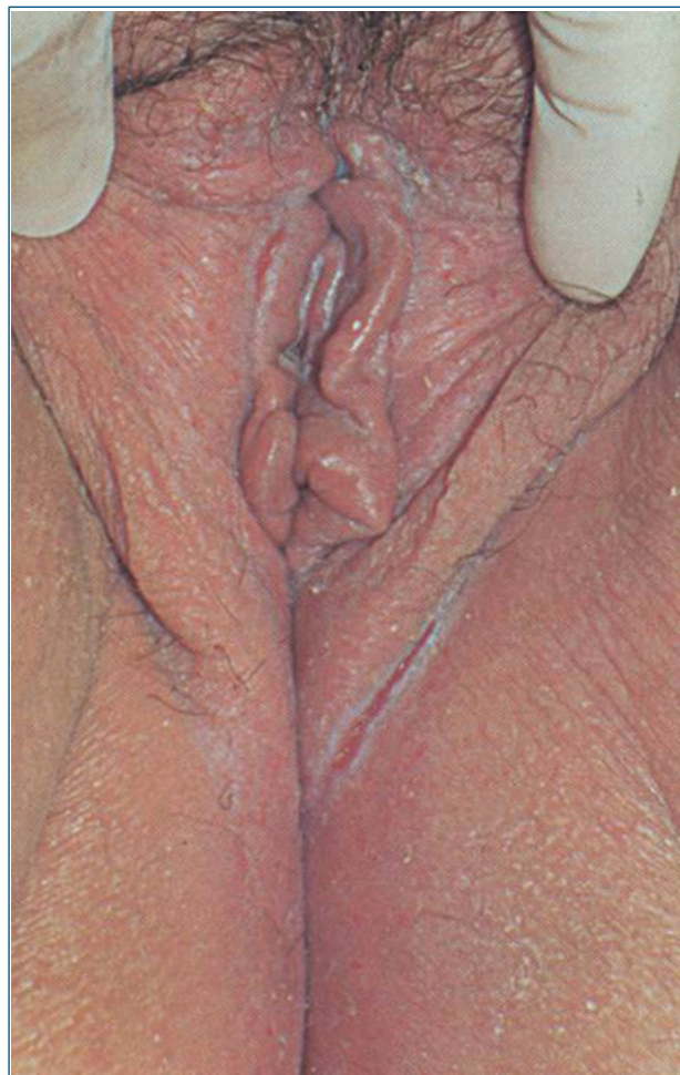
Figure 8. Lichen Simplex Chronicus Note edematous labia and fissuring on the labial sulcus and perineum.