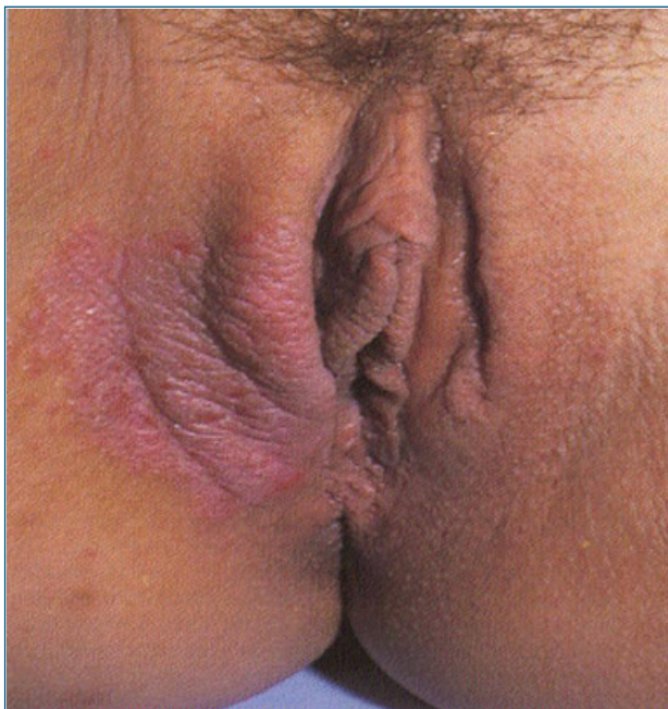
Figure 6. Lichen Simplex Chronicus Note the characteristic thickened, leathery appearance of the vulva.