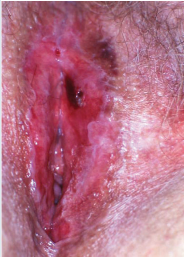
Figure 5. Lichen Planus Note the violaceous border with the characteristic lacy appearance.